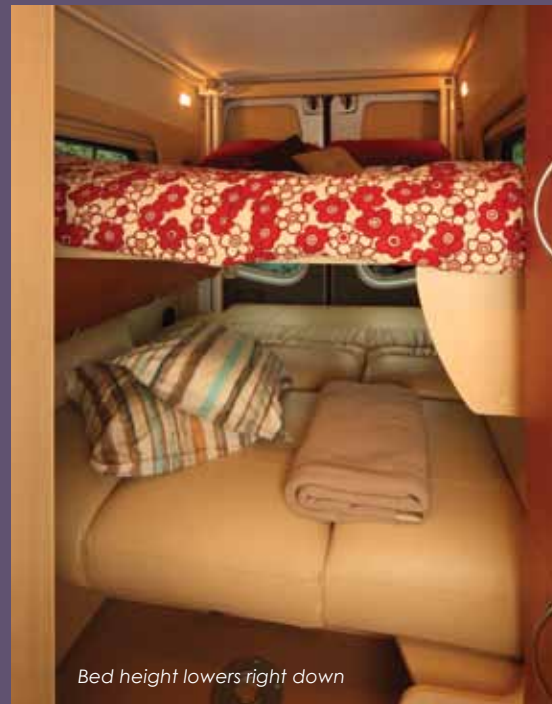
Bed height lowers right down